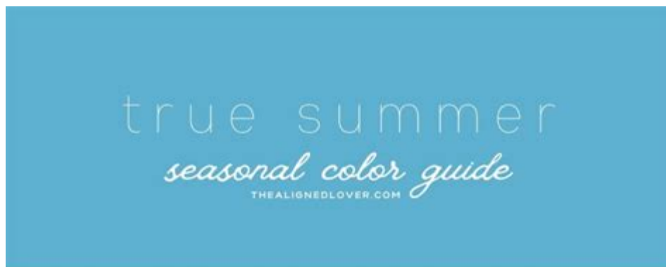
TRUE SUMMER COLORS