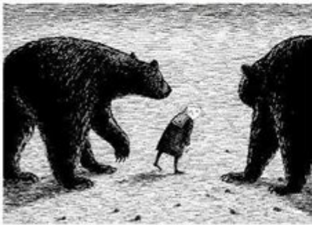
B is for Basil assaulted by bears.