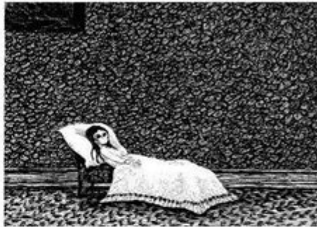
C is for Clara who wasted away.