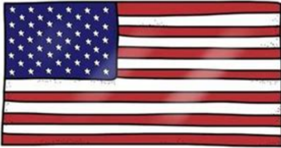
The Star Spangled Banner