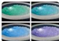
Color-changing LED light creates a unique ambience Requires 3 AAA batteries (not included)