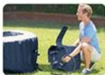
Built-in inflation system