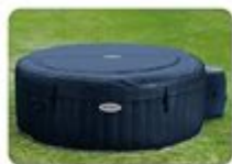
Insulated cover to minimize heat loss