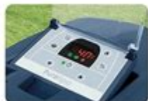
Easy-to-use, tilt-adjustable control panel