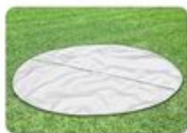
Insulated ground cloth