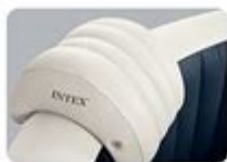
2 headrests included