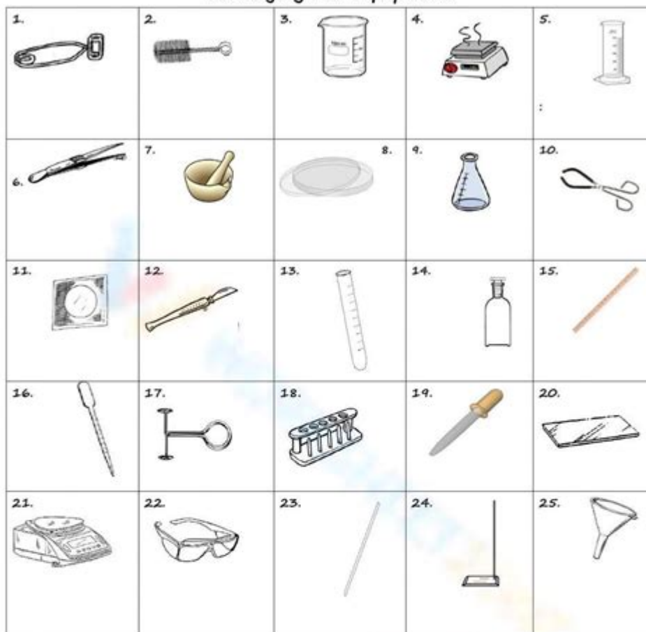
Identifying Lab Equipment