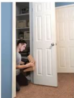
Opening object within dwelling = no breaking

Illinois bar exam pass list is a crucial document for aspiring attorneys in the state of Illinois. Each year, thousands of law school graduates undertake the Illinois bar exam, a rigorous assessment designed to evaluate their knowledge of the law and readiness to practice. The results, including the pass list, serve as an essential benchmark for both candidates and legal institutions. In this article, we will explore the importance of the Illinois bar exam, the examination process, the significance of the pass list, and tips for prospective examinees.