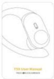
User Manual x1

Golrex Bluetooth Headphones Manual is an essential guide for anyone looking to maximize their experience with these advanced audio devices. As Bluetooth technology continues to evolve, Golrex has positioned itself as a trusted brand that delivers high-quality sound, comfort, and convenience. In this article, we will delve into the features, setup instructions, troubleshooting tips, and maintenance advice for your Golrex Bluetooth headphones, ensuring you get the most out of your purchase.