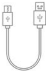
Type-C Charging Cable x1