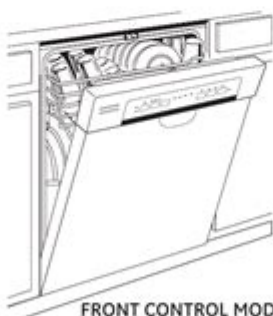
FRONT CONTROL MODELS

La sección en español empieza en la página 33