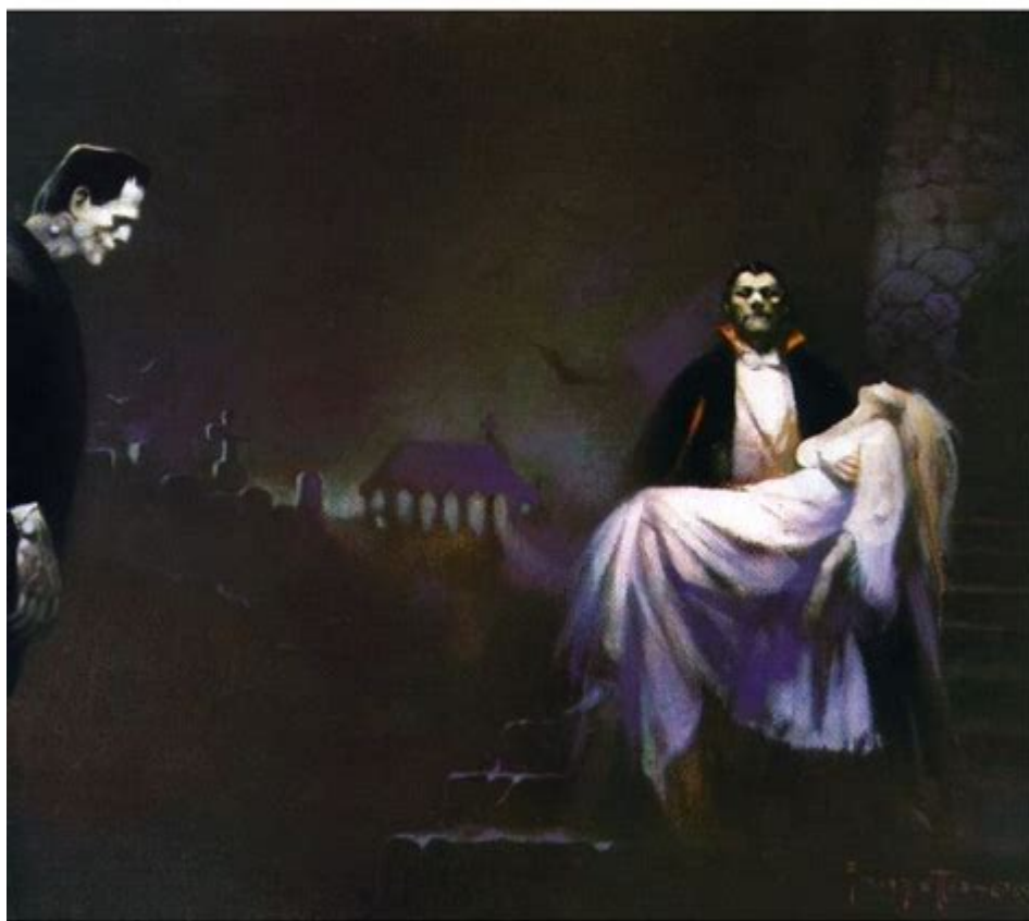
Dracula Frankenstein Cover by Frazetta

The world of graphic art has often been transformed by the vision of artists who have redefined