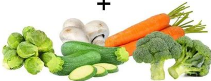
Low- Glycemic Veggies