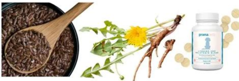
Nutritional Supplements For Adrenals

For More Information Visit WaggingRight.com