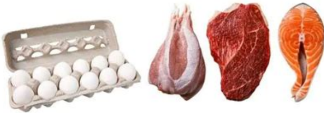
Highly Digestible Protein