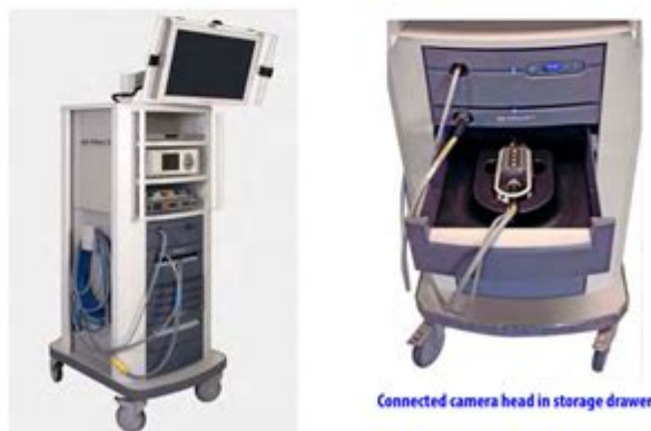
Figure 4.10 Store camera cables connected