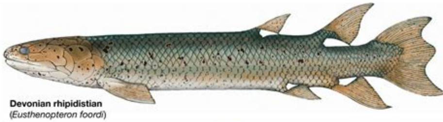
Devonian rhipidistian ( Eusthenopteron foordi )