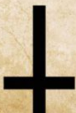
CROSS OF ST. PETER