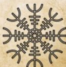
MAGICAL STAVES OF ICELAND