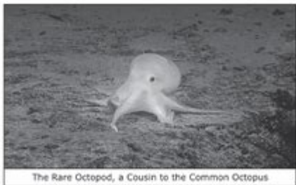
The Rare Octopod, a Cousin to the Common Octopus