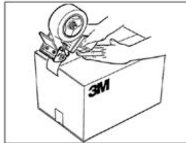
Box Sealing Tape Dispenser HR 80 / HR 83